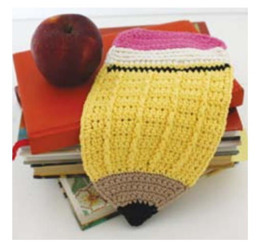
LILY® SUGAR'N CREAM® PENCIL DISHCLOTH (TO CROCHET)